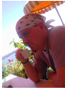
Coffee in Istanbul