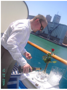
Champagne breakfast in the Med