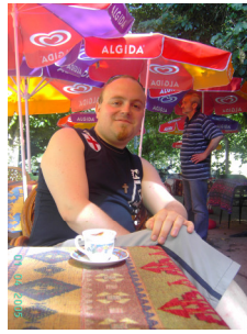
Coffee in Ephesus