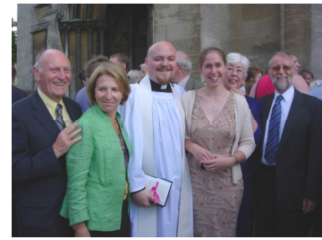
Outside St Albans cathedral